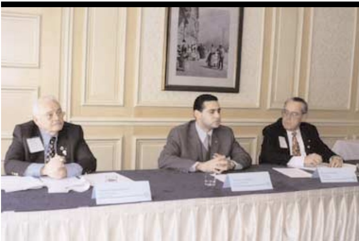
A typical group during a breakout session: Three of the Rotaractors and Rotarians tackle the weighty agenda at the Vienna conference.